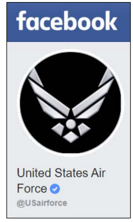
Figure 2: USAF Facebook Page Verified Status

DAF members who are considered public figures, such as general officers, senior executives, or public affairs officers, should ensure their social media accounts are verified. A verified account provides a higher degree of legitimacy to that account. These accounts will usually display an icon that indicates the authenticity of the account (e.g. a blue or grey check mark on the account). The verified icon and the process